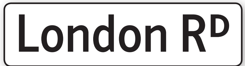
Example of the superior small capitals in use

More information and sample PDFs can be found at www.typography.net/type/wayfarer.htm .